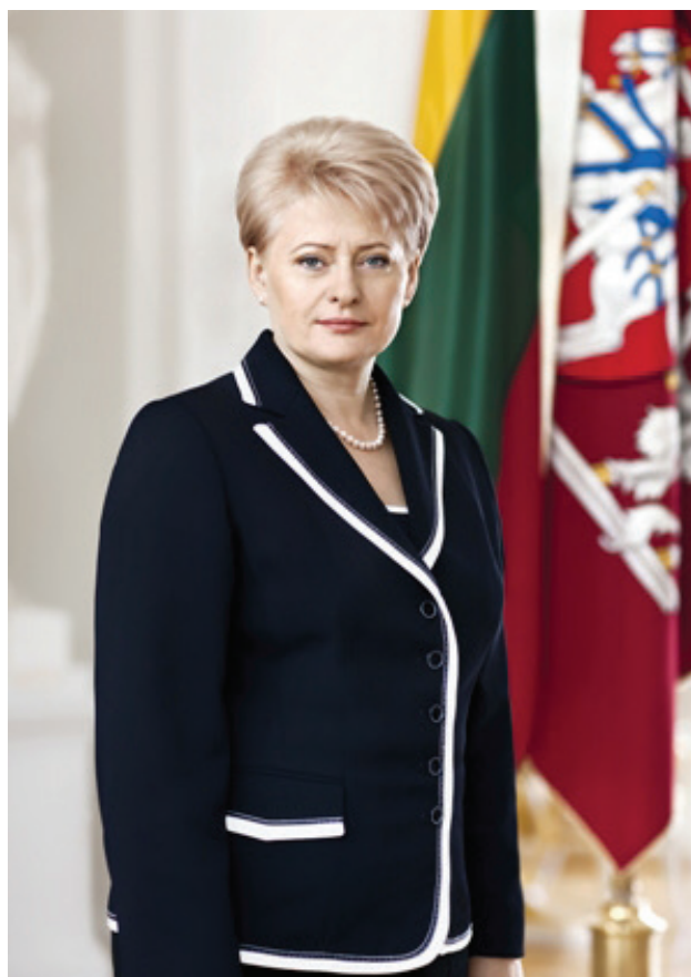
Patronage Dalia Grybauskaitė President of the Republic of Lithuania